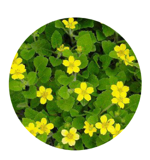
GREEN AND GOLD