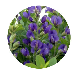
BLUE FALSE INDIGO

Habitat: Full Sun, Dry to Moist Soil Blooms June-September, white, flower stalk can rise 5-10 feet above foliage, evergreen.