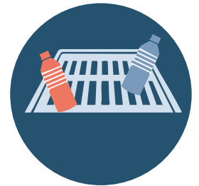
Blocked Storm Drains