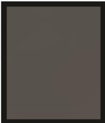
Vacant District 5