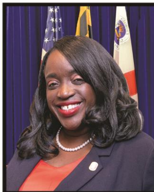
Wala Blegay District 6