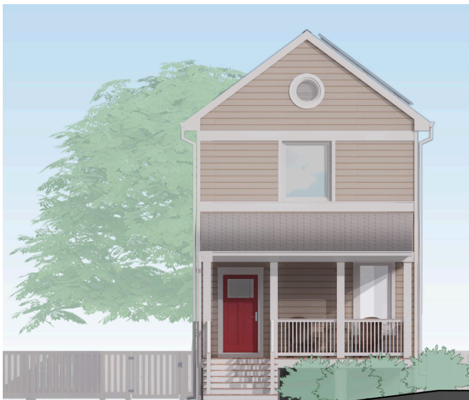
Net Zero Energy Homes - Front Elevation

715 - 725 60th Place | Fairmount Heights 20743