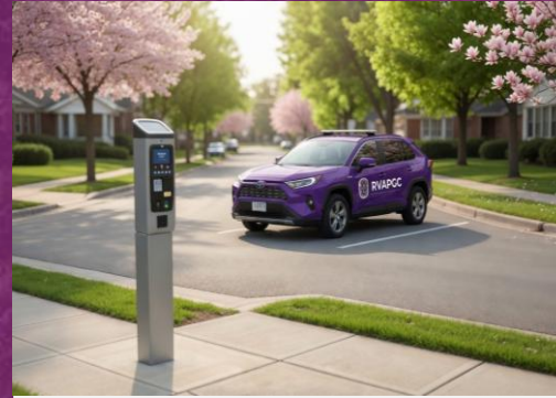
Parking Enforcement/ Management

“Prioritizing Public Safety, While Elevating Community Development”