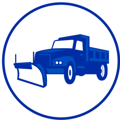
Office of Highway Maintenance