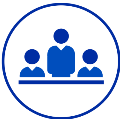
Office of the Director