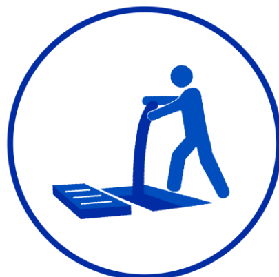
Office of Storm Drain Maintenance