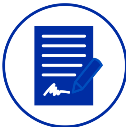
Office of Administrative Services