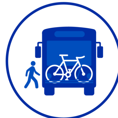
Office of Transportation