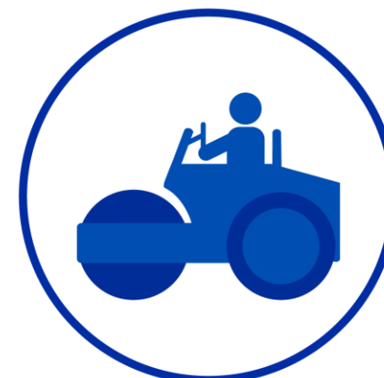
Office of Engineering and Project Management