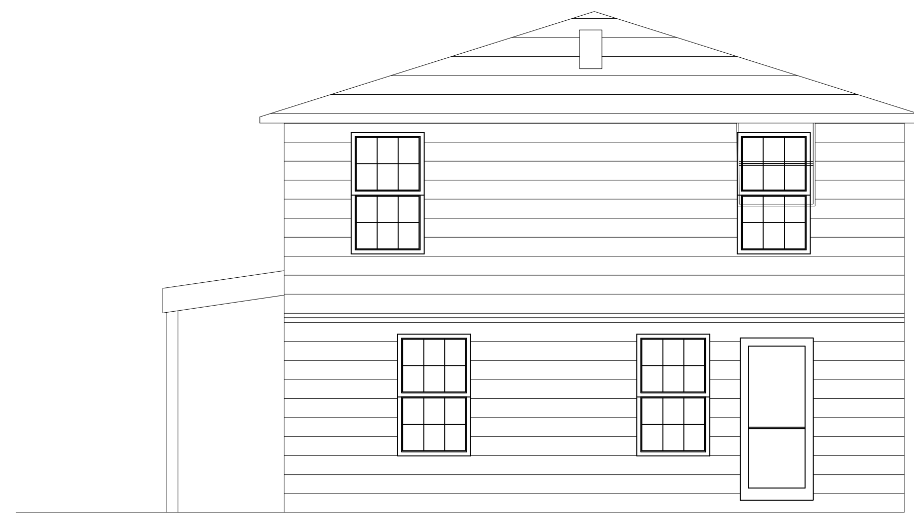
2 RIGHT SIDE ELEVATION A101 SCALE: 1/4" = 1'-0"