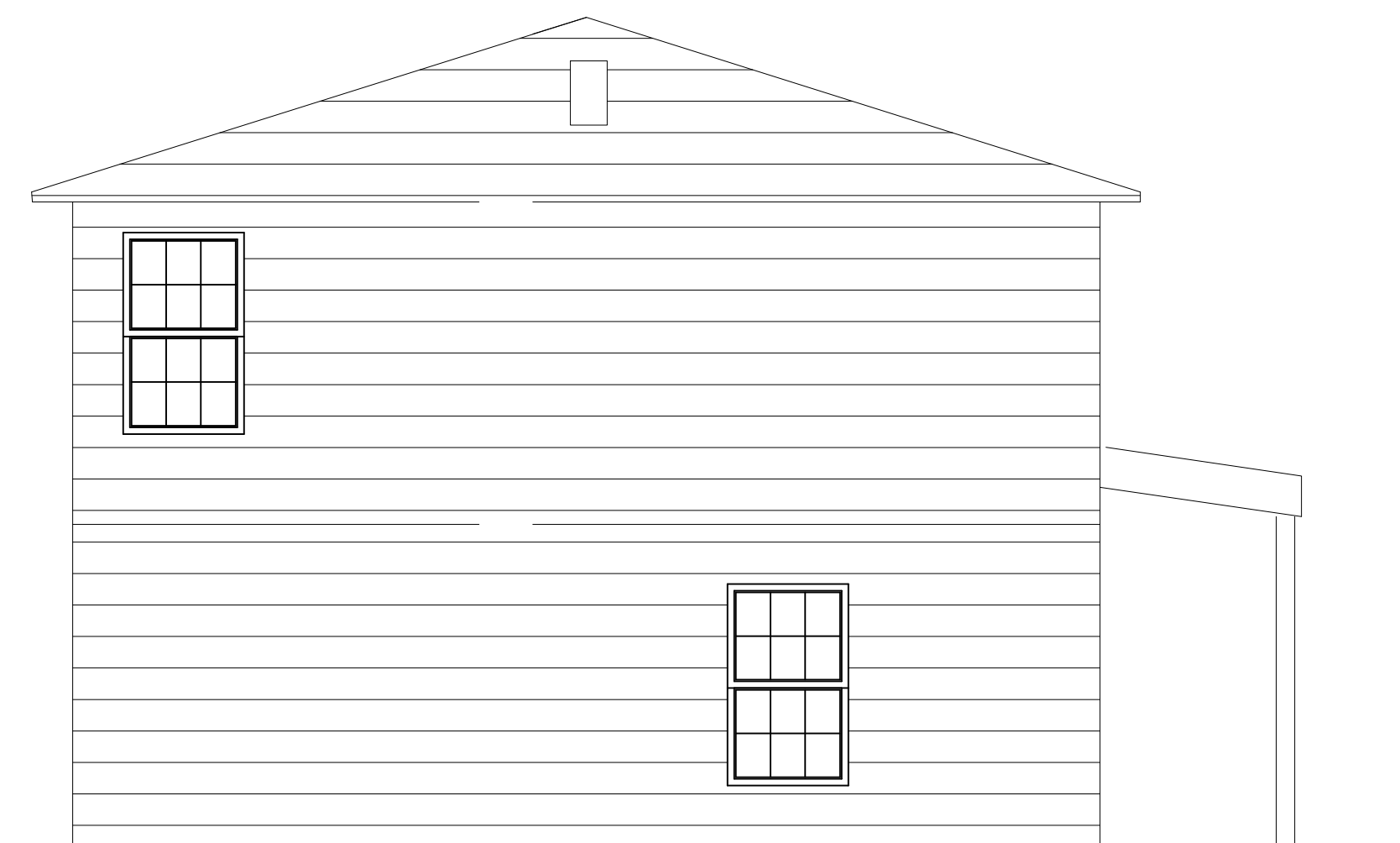
4 LEFT SIDE ELEVATION A101 SCALE: 1/4" = 1'-0"

WARNING AND DISCLAIMER This drawing is intended only to be illustrative of the minimum requirements of applicable County ordinances. It is not to be used for any other purpose and applications. PRINCE GEORGE'S COUNTY, MARYLAND DOES NOT WARRANT OR GUARANTEE IN ANY MANNER OR TO ANY EXTENT THE SUFFICIENCY OF THIS DRAWING. Persons to whom this drawing is distributed should not rely on it as an accessible plan or blue print for any structure. PRINCE GEORGE'S COUNTY, MARYLAND SHALL BE HELD HARMLESS FROM DAMAGES OR INJURIES, DIRECT OR CONSEQUENTIAL, ARISING OUT OF THE USE OF THIS DRAWING.