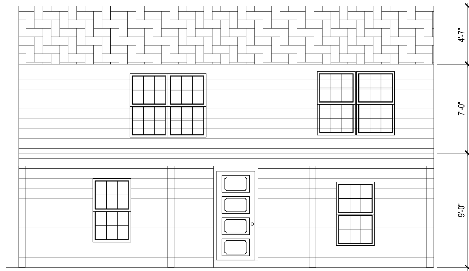
1 FRONT ELEVATION A101 SCALE: 1/4" = 1'-0"