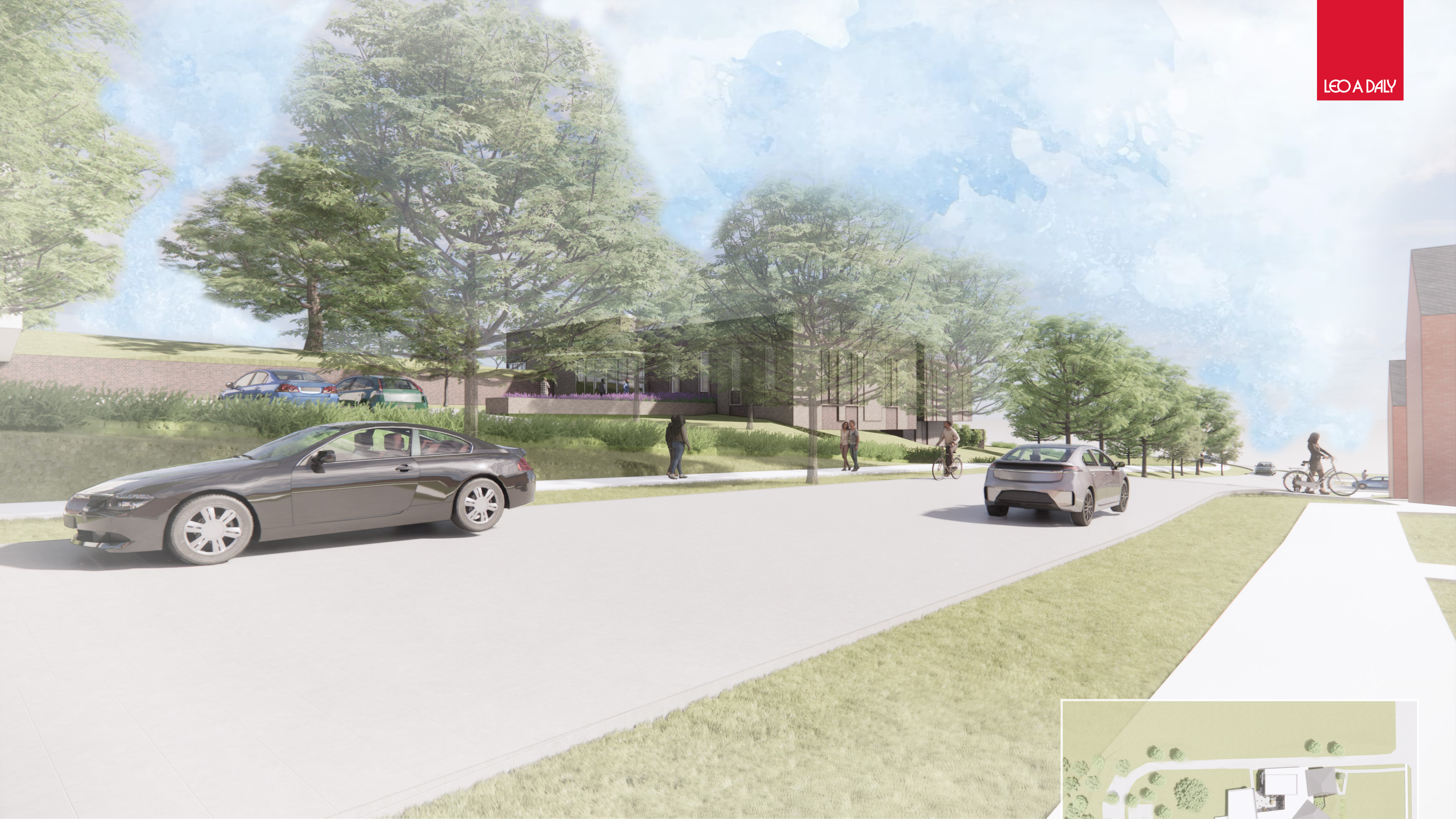
VIEW 1 - ERNIE BANK ST LOOKING TOWARDS ADDISON ROAD S