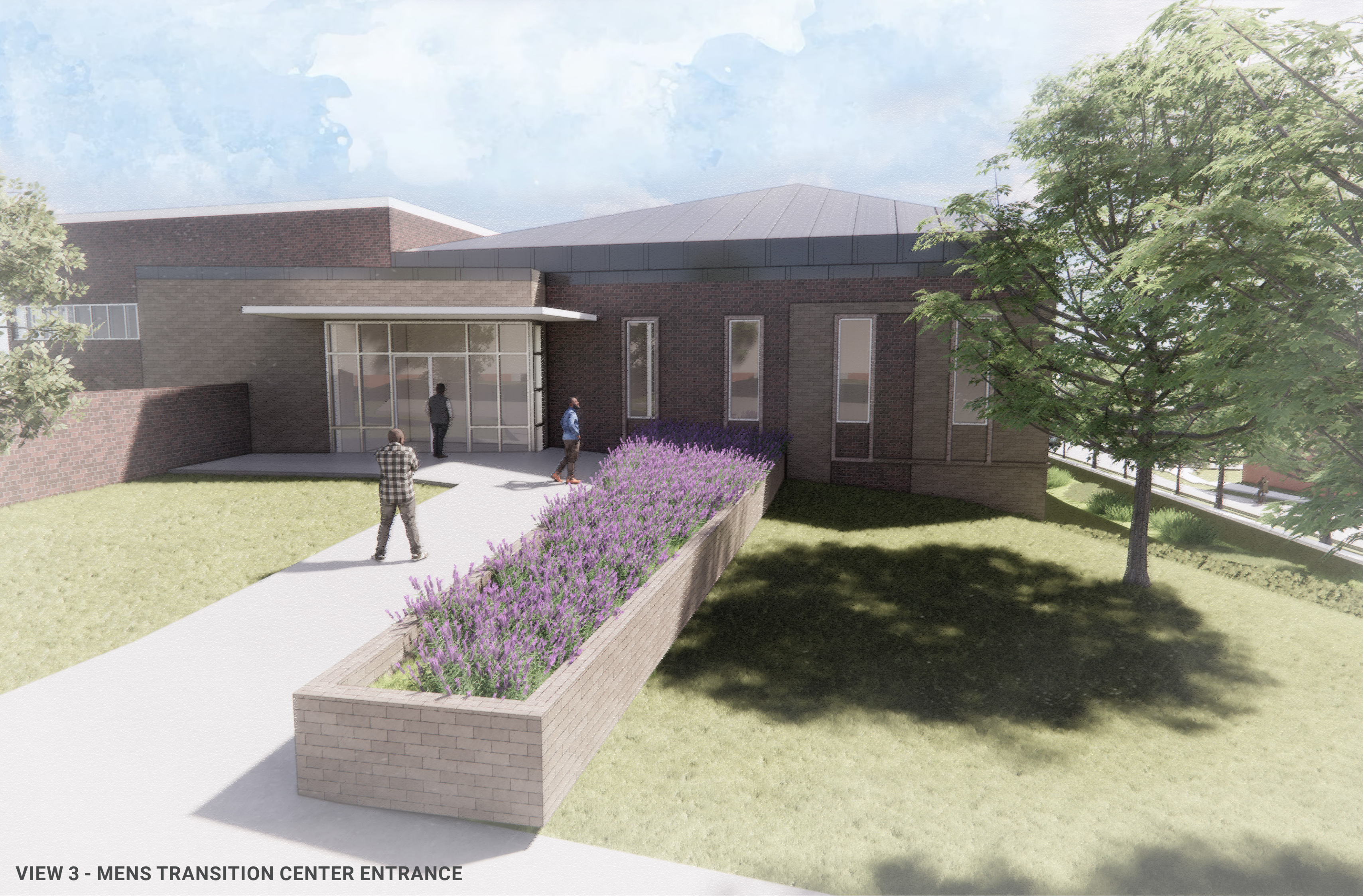
VIEW 3 - MENS TRANSITION CENTER ENTRANCE