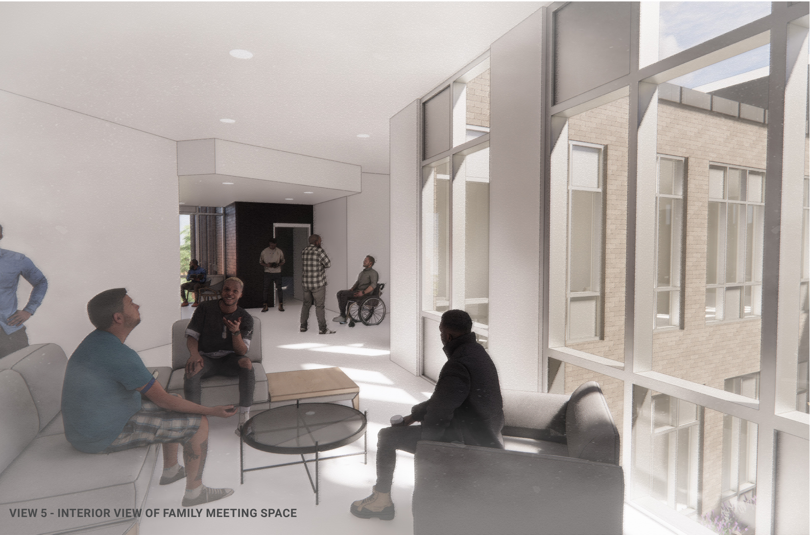
VIEW 5 - INTERIOR VIEW OF FAMILY MEETING SPACE