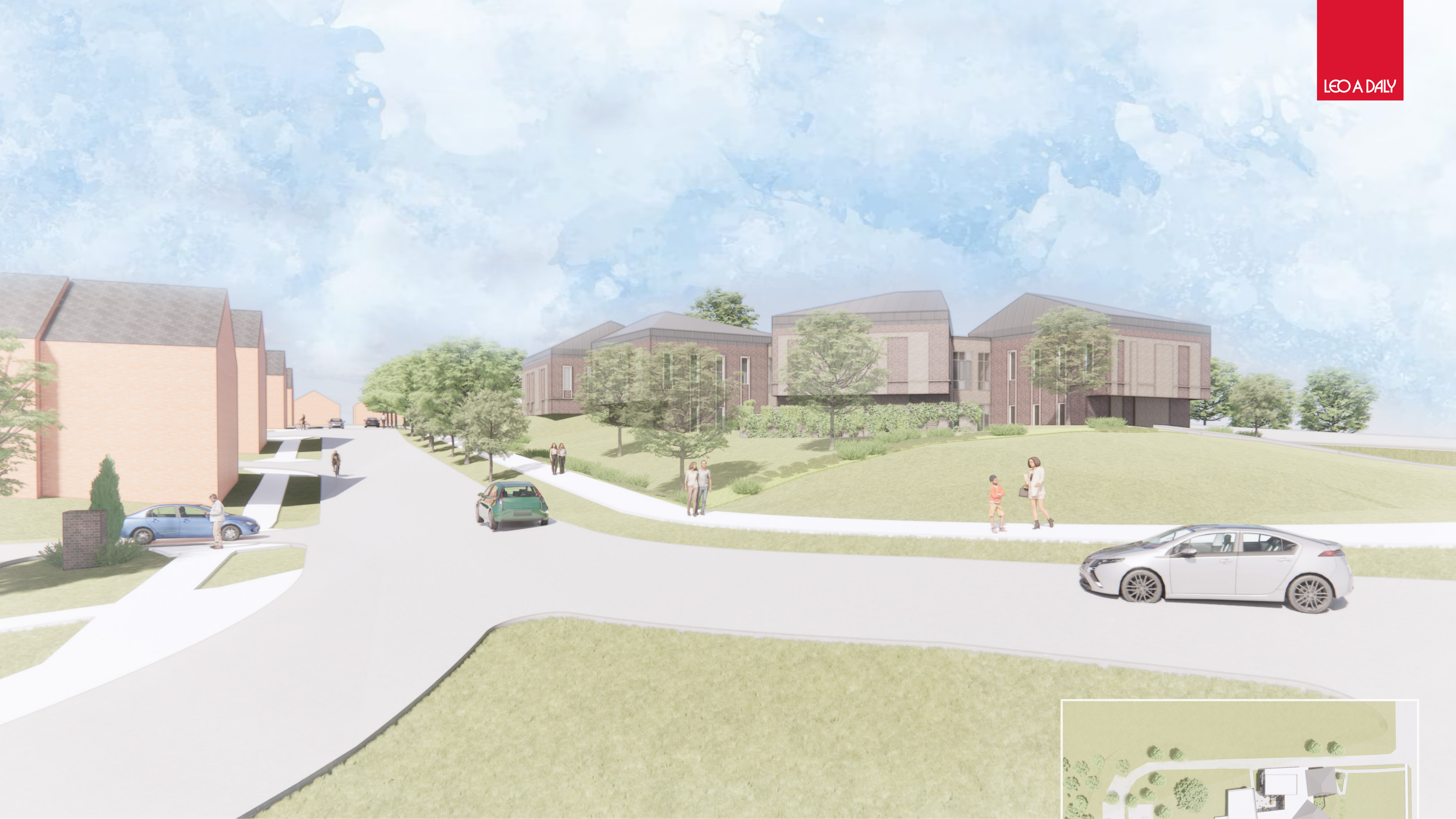
VIEW 2 - ADDISON ROAD S