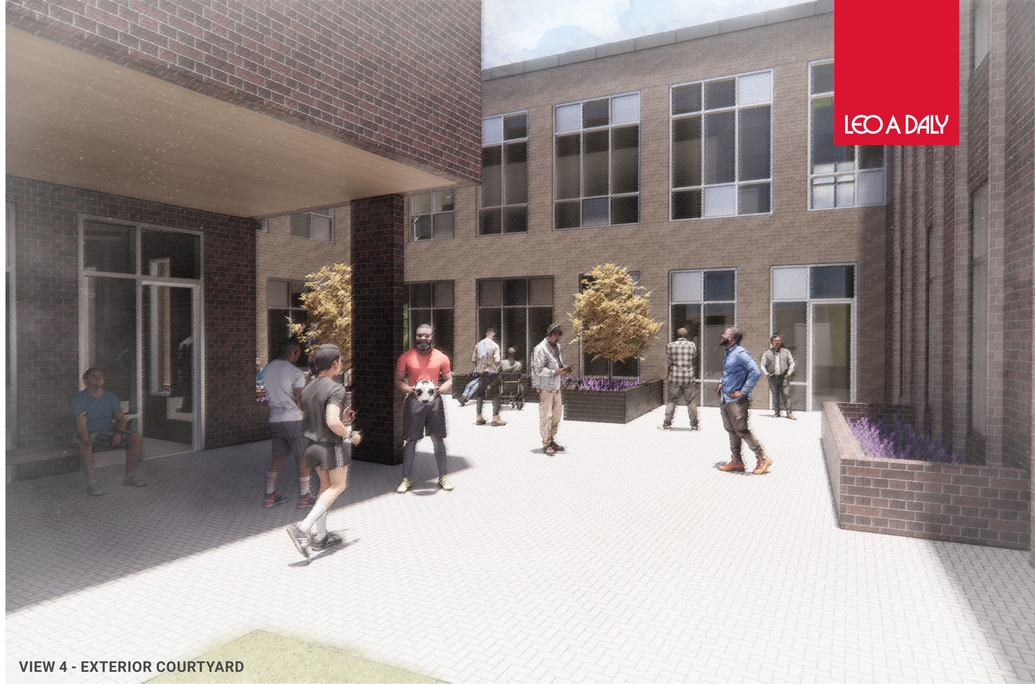
VIEW 4 - EXTERIOR COURTYARD