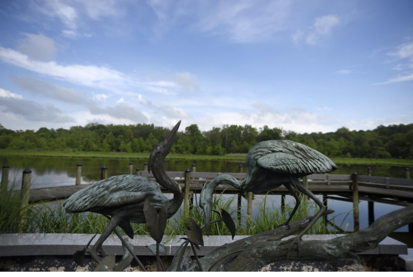
NATURAL RESOURCES, ENVIRONMENT, AND AGRICULTURE