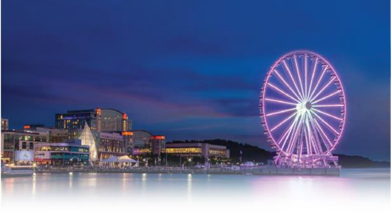
July 1, 2022

I am extremely proud to present the 90 Day Report – A Review of the 2022 General Assembly's Legislative Session. This report includes breakdowns of the Operating and Capital Budgets for fiscal year 2023, as well as the bills of the House and Senate County Delegations. In addition, included are the statewide bills that impact Prince George's County categorized by key legislative areas. The summaries of bills contained in the Report seek to provide a cursory explanation of the changes in the law and the relevant background on the changes, as needed.