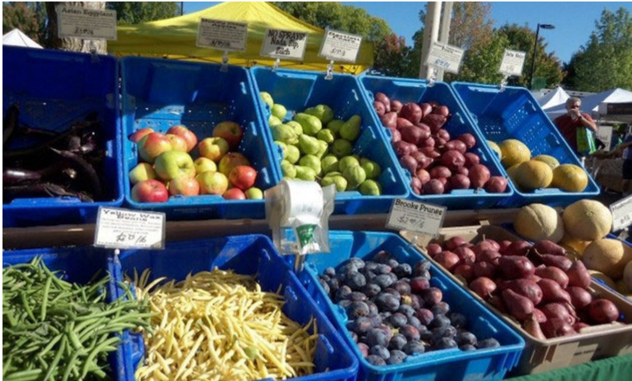
Farmers' Markets are operating under COVID guidelines.