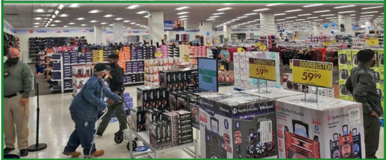
Shoppers World at the Shops at Iverson opened in November.

The BDS Team recently assisted Shoppers World in Hillcrest Heights with the permitting and licensing process. Shoppers World is a department store that sells apparel for all ages, in addition to home furnishings, linens and other home décor goods. The Iverson store is the