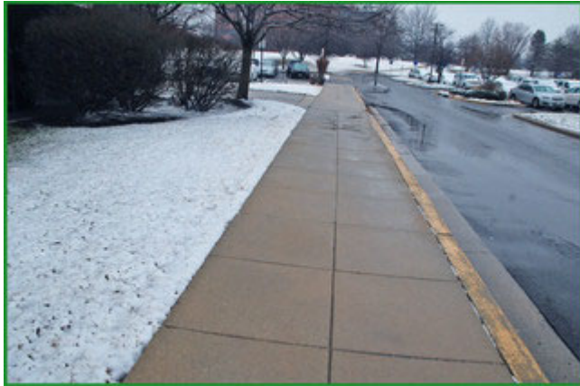
Snow-free business sidewalk.

Business owners with properties abutting a sidewalk are required to keep the walkways free of obstructions such as tree limbs, shrubbery and other debris. They are also required to remove snow and ice within 48 hours of it accumulating to two inches or more or face possible fines.