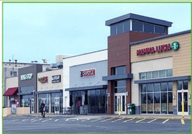
The Shops at Iverson, located on Branch Avenue in Temple Hills, feature retail, restaurant and office space.