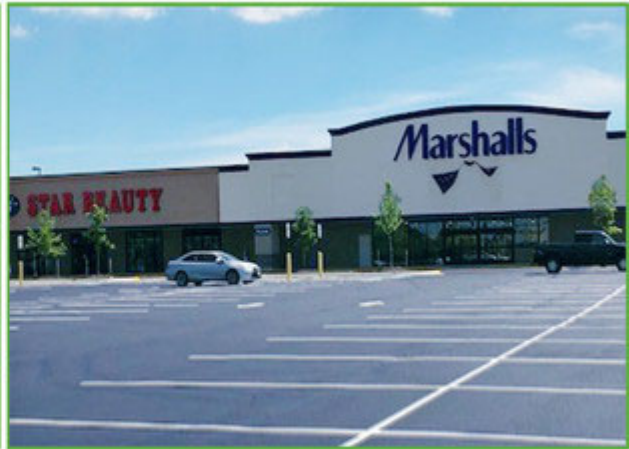
Landing at Woodyard — A mixed-use shopping center located at Woodyard Road and Branch Avenue features a growing list of stores and restaurants.