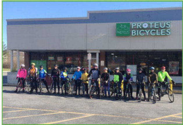
From left to right, top to bottom: Lidl Food Market — This international grocery store chain is expanding in Prince George's County; PJ's Coffee — This franchise eatery opened in Bowie in August 2020; Physiocare — Located in the Eastgate Shopping Center in Lanham, Physiocare provides rehabilitative and wellness treatment to patients in the surrounding area; Proteus Bicycle Shop — Proteus, located in College Park, opened a coffee shop to serve customers while waiting for bicycle services.