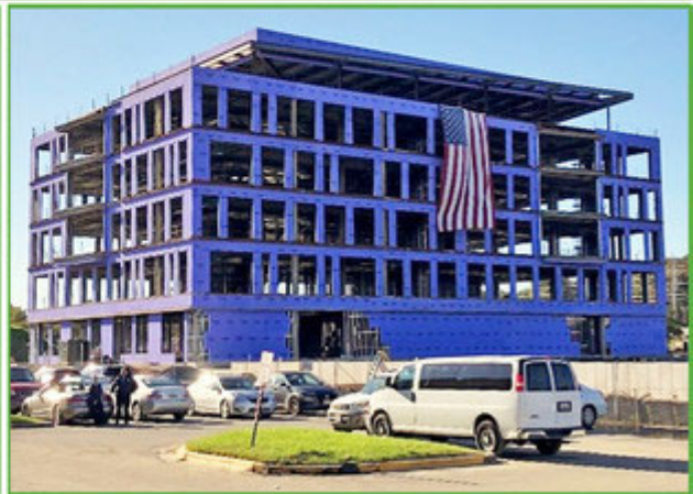
Hampton Park project site renderings and office building under construction.