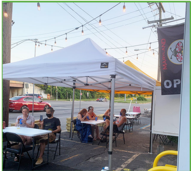
2Fifty Central Texas BBQ — This Riverdale Park eatery added outdoor seating to accommodate customers and abide by social distancing mandates. Previously, it operated at the Riverdale Park Farmers' Market. Shortcake Bakery and Maryland Meadworks , located side by side in Hyattsville (middle and bottom photo sets), opened their outdoor seating areas in July 2020.