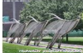
rainwater sculpture channels