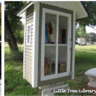
Little Free Library