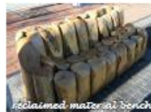
reclaimed material bench