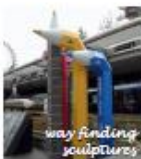
way finding sculptures