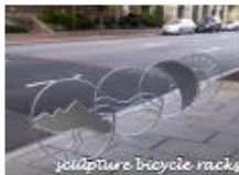
sculpture bicycle racks