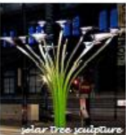
solar tree sculpture