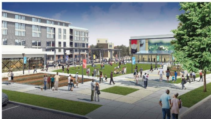
Figure 3. Conceptual Rendering of Towne Square at Suitland Federal Center