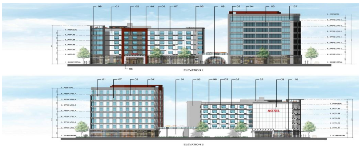
Figure 2 Conceptual elevational renderings of Parcels J1 and J2