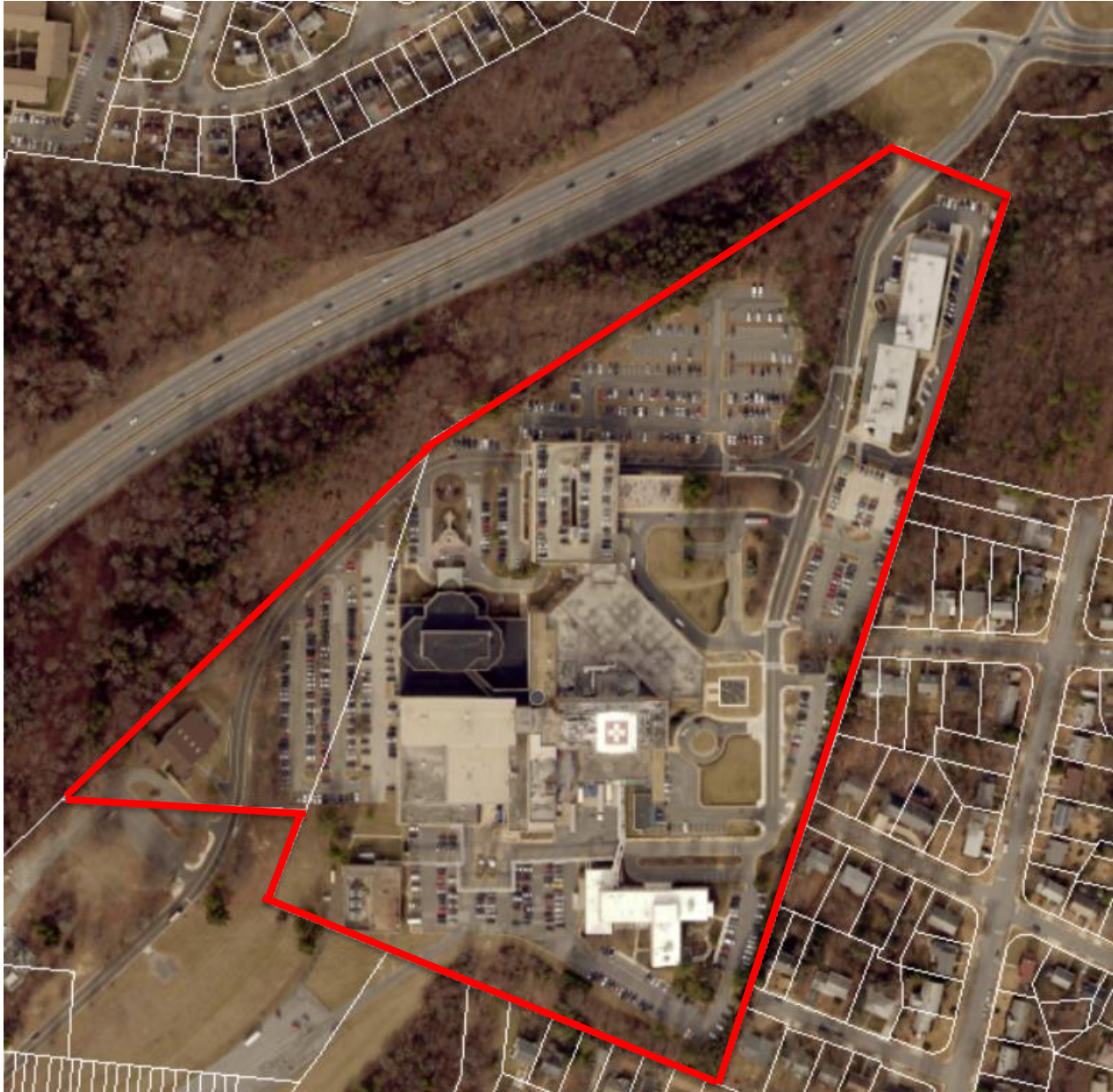
Fig. 1. Development Boundary – Cheverly Hospital Site