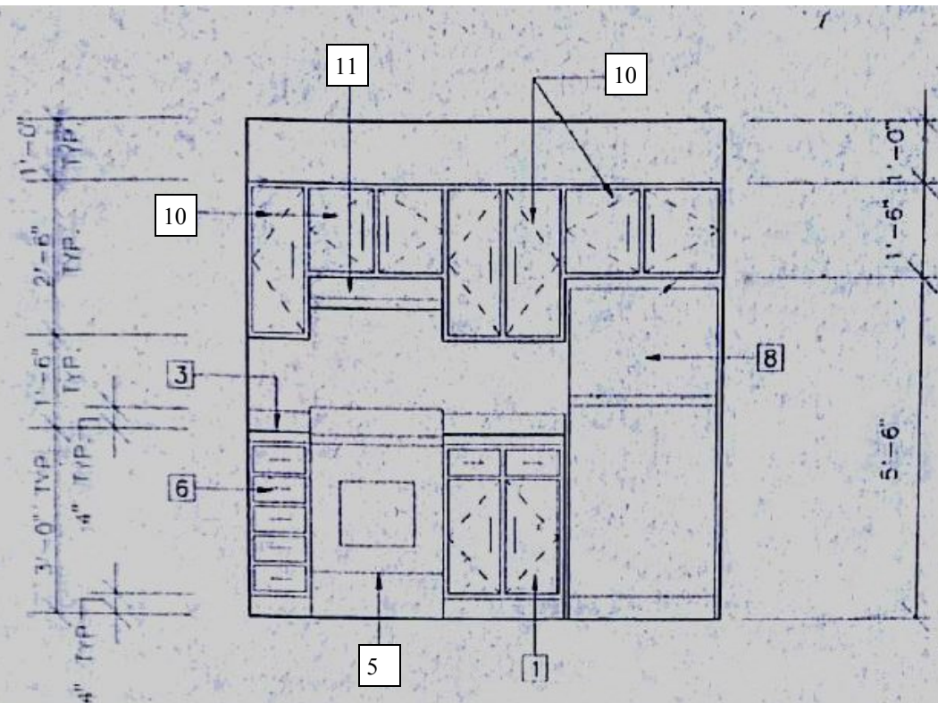
1 TYPICAL KITCHEN (1 BEDROOM) A1/A16 SCALE: 1/2" = 1'-0" (BLDGS. A,B,C,D)