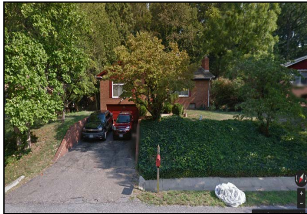
Photo 1. Incident Scene.

This incident occurred at a one-story, 1,600-square foot, residential single-family dwelling located within city limits. The structure included an in-basement garage and contained 4 bedrooms and 2 baths. The structure faced a two-lane city street (See Photo 1 and Diagram 1).