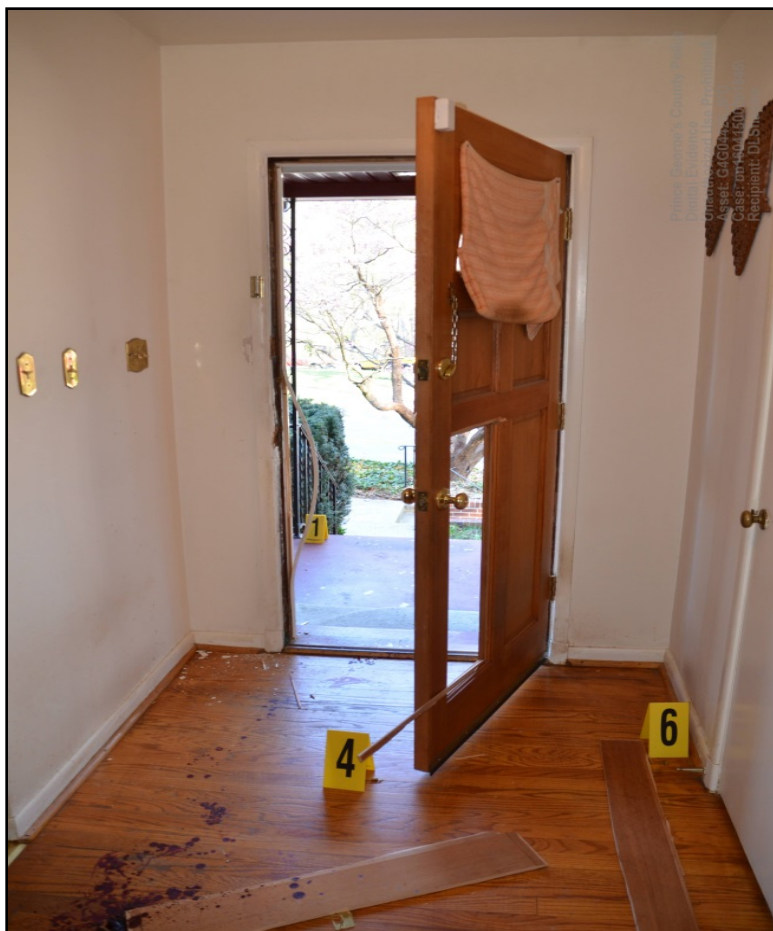
Photo 3. Incident Scene. Photo taken from inside the residence facing the front entrance shows the front door which was forced open by the responding fire fighters. Numbered markers were placed by the local police department.