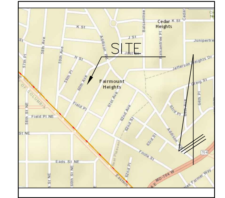
VICINITY MAP SCALE: 1"=2000'

SITE ANALYSIS All Lots Except 12-14 ZONING REQUIREMENTS ZONE: R-55 USE: SINGLE FAMILY DETACHED 1. Minimum Lot Area: 5,000 SF 2. Min. Street Frontage: 40' 3. Min. Front Building Line: 50' 4. Setback Front: 25' Side: 7'/14' (Total Both Sides) Rear: 20' 5. Building Heights 35' 6. Building Lot Coverage: 30% See BRL on Plan