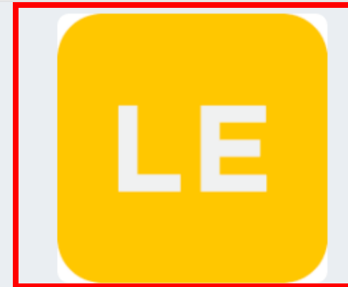
Prince George's County Learning Management System (LMS) (Employee-Only Access)

Please click the image below to access the new Prince George's County Learning Management System.