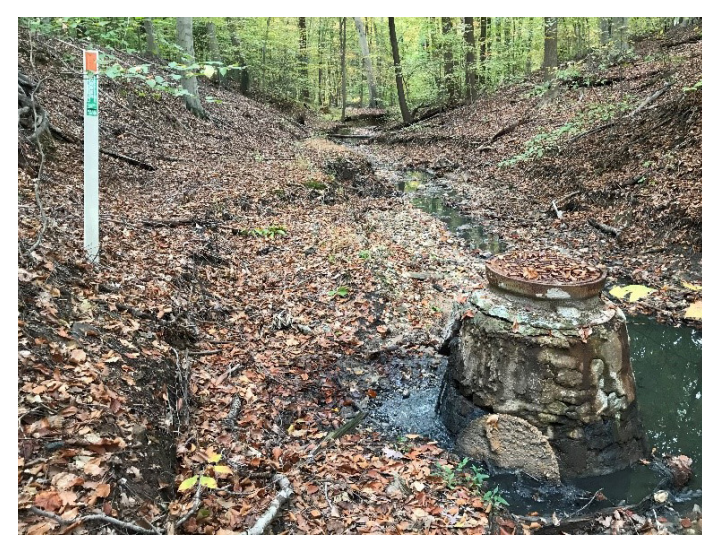
Sewage overflow found in stream. Sewer was unclogged by WSSC.

Prince George's County's NPDES permit covers all stormwater discharges from the municipal separate storm sewer system (MS4) owned or operated by Prince George's County, Maryland, and all incorporated municipalities within the County. The permit contains limits on what can be discharged, as well as monitoring and reporting requirements. This includes the implementation of an inspection and enforcement program to ensure that all discharges to and from the MS4, that are not composed entirely of stormwater, are either permitted by MDE or eliminated.