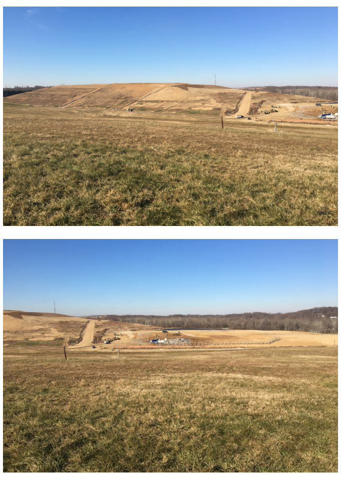
Brown Station Road Sanitary Landfill Area "C"