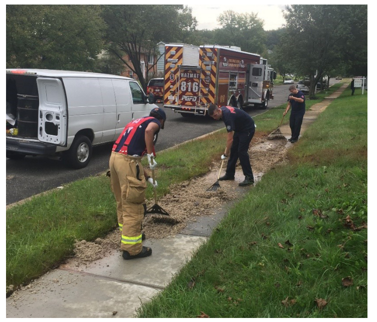
County HAZMAT team puts down absorbents to clean up heating oil.