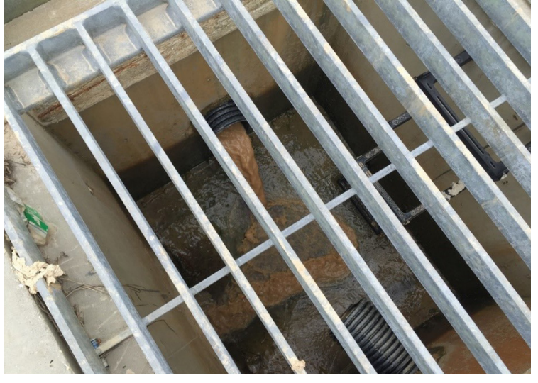
Sediment laden stormwater being discharged into an inlet.

The Department of the Environment's Stormwater Management Division, Inspection and Compliance Section (ICS), develops, implements and maintains a program to help reduce the amount of pollutants entering the County's storm drain systems which lead to our streams, rivers and eventually the Chesapeake Bay. The Illicit Discharge Detection and Elimination Program (IDDE) allows us to investigate and respond to illicit discharges, illegal dumping, and spills by using the appropriate enforcement procedures to eliminate these types of issues throughout Prince George's County.