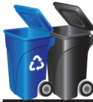
RECYCLING AND TRASH

Residents will be able to place two (2) items OR two (2) bags for collection next to their trash cart for collection on their regularly scheduled curbside trash and recycling collection day. Bulky items NOT PLACED NEXT TO TRASH CART WILL NOT BE COLLECTED.