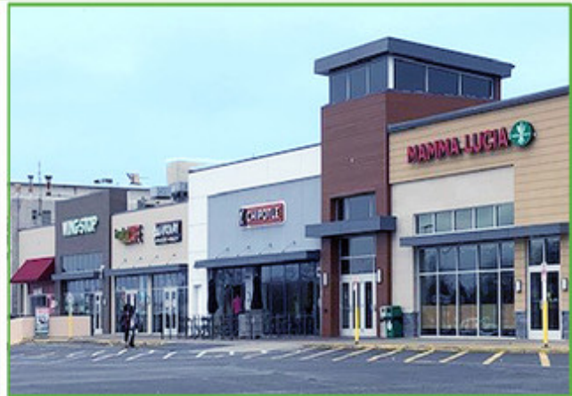
The Shops at Iverson , located on Branch Avenue in Temple Hills, feature retail, restaurant and office space.