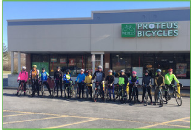
From left to right, top to bottom: Lidl Food Market — This international grocery store chain is expanding in Prince George's County; PJ's Coffee — This franchise eatery opened in Bowie in August 2020; Physiocare — Located in the Eastgate Shopping Center in Lanham, Physiocare provides rehabilitative and wellness treatment to patients in the surrounding area; Proteus Bicycle Shop — Proteus, located in College Park, opened a coffee shop to serve customers while waiting for bicycle services.