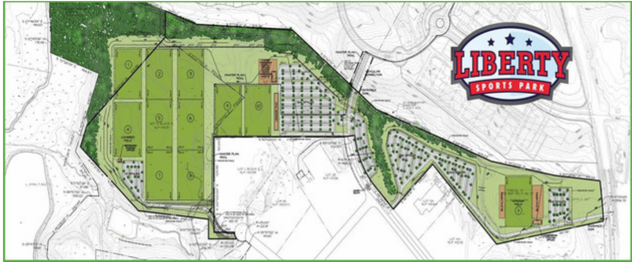
Liberty Sports Park rendering of the 76-acre sports complex located just outside of Bowie.

This sports park is designed as a complex of multi-use athletic fields located on 76-acres near the intersection of routes 214 and 301. Initially, the sports park will feature 10 lighted grass and synthetic fields. A stadium field is planned for large competitions. The fields will accommodate football, field hockey, lacrosse, rugby, soccer and ultimate frisbee.