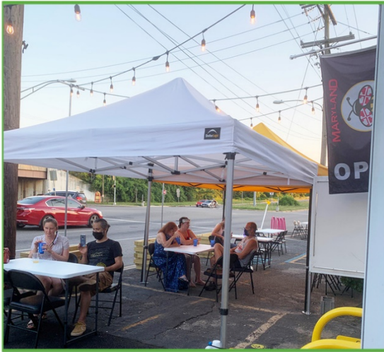
2Fifty Central Texas BBQ — This Riverdale Park eatery added outdoor seating to accommodate customers and abide by social distancing mandates. Previously, it operated at the Riverdale Park Farmers' Market. Shortcake Bakery and Maryland Meadworks , located side by side in Hyattsville (middle and bottom photo sets), opened their outdoor seating areas in July 2020.