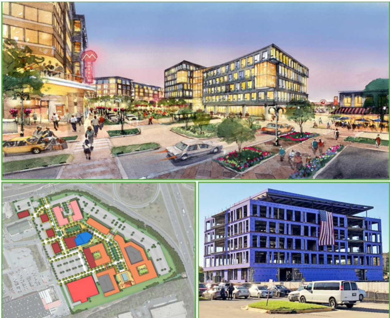
Hampton Park project site renderings and office building under construction.

This project focuses on the redevelopment of the Kingdom Square Shopping Center on Central Avenue at I-495, at the former Hampton Mall site. The 25-acre mixed-use development, renamed Hampton Park, will be comprised of a hotel, office building, restaurants, retail establishments and apartments. The Department of Health and Human Services (DHHS) and the Department of Veterans Affairs (VA) will have offices within the development.