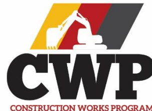
Construction Works Program