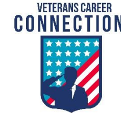
Veterans Career Connection