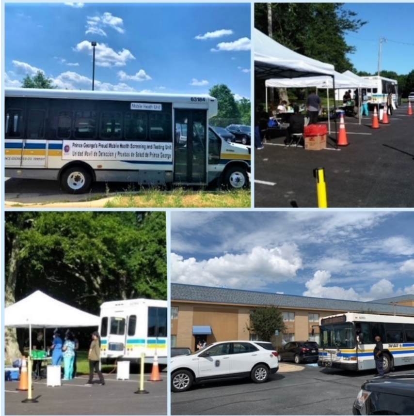
COVID-19 (Coronavirus) Testing and Emergency Transport

The Agency also partnered with the Office of Emergency Management and the Department of Social Services to transport 40 men from a men's shelter in Capitol Heights to alternative housing in Beltsville, helping support safety precautions and social distancing requirements. We strive to support all of our agencies, employees and Prince Georgians.