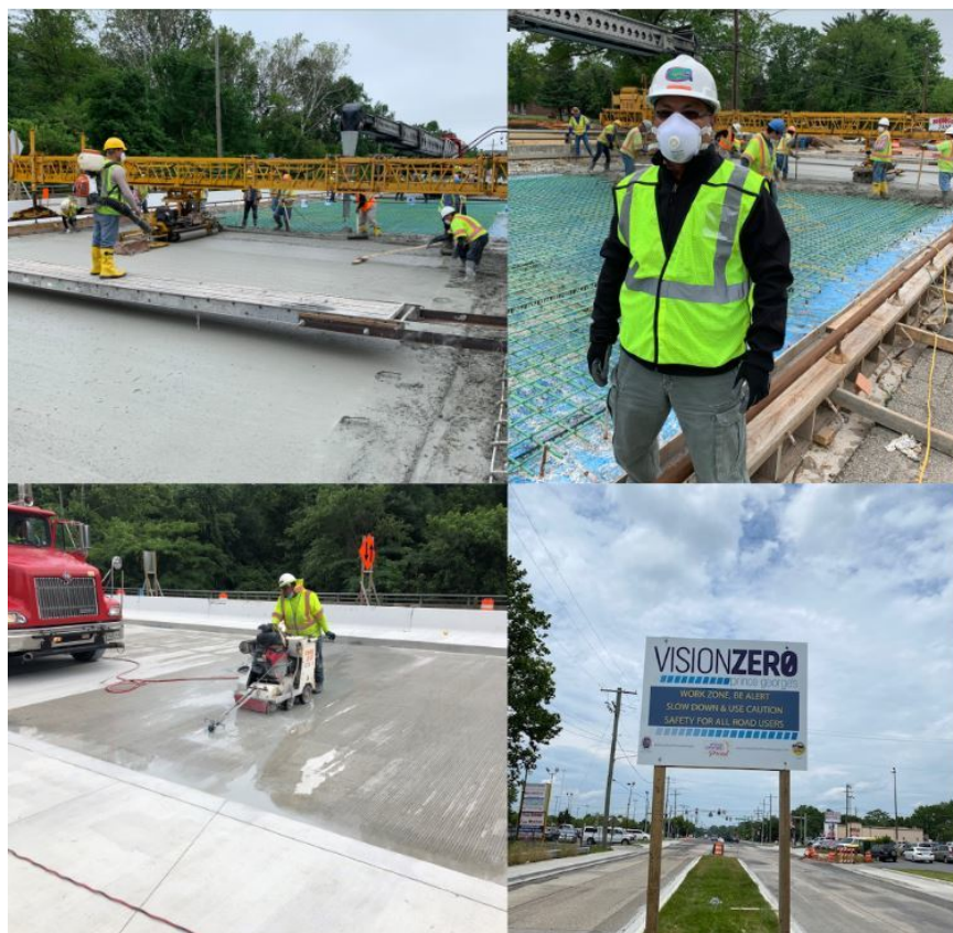
Ager Road Green Complete Street Capital Improvement Project (CIP)