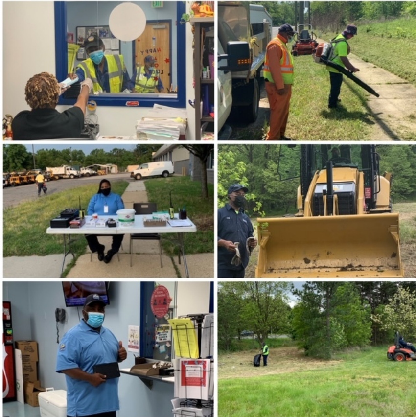
Personal Protective Equipment (PPE) Distribution and mowing operations

Even during these uncertain times, our employees have remained steadfast and continue to serve Prince George's County daily with stellar service, while taking necessary safety precautions. Thank you for all the extraordinary things you do!