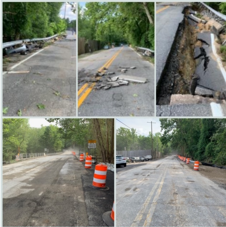
Damage and repairs at 11700 Brandywine Road

Over the last few weeks, DPW&T crews responded to hazardous road conditions caused by flooding due to heavy rainfall. In some cases, crews worked into the night to ensure roadways were cleared, repaired and safe.