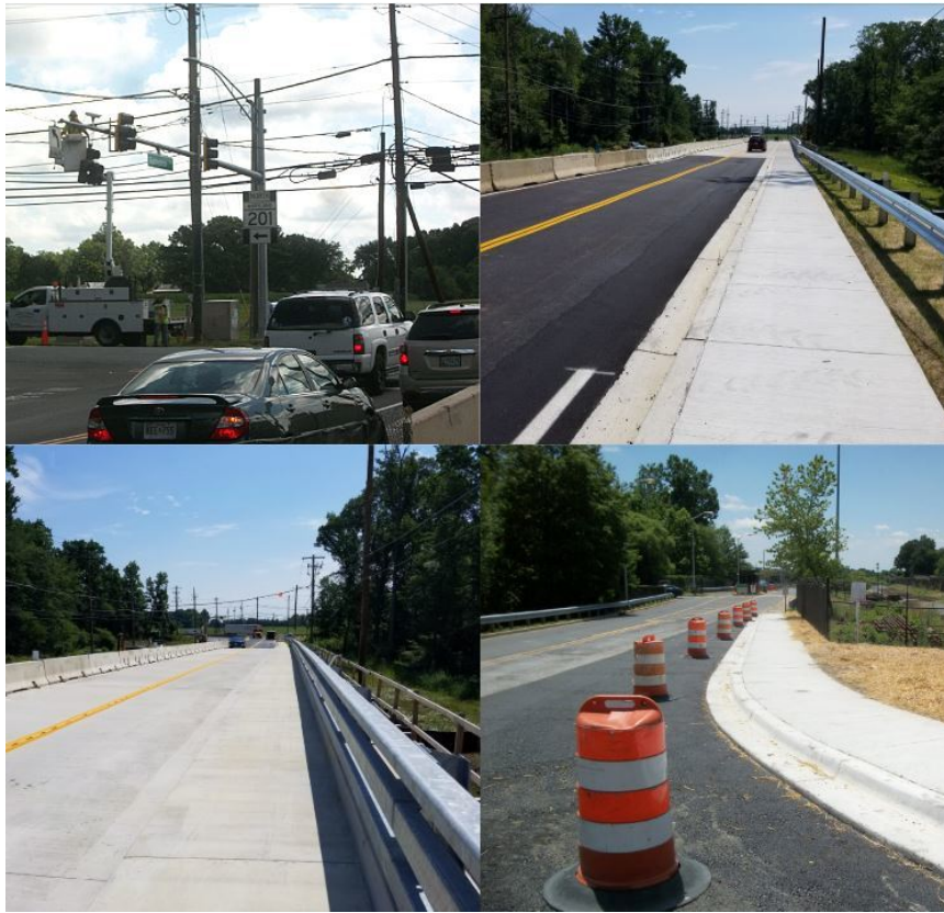
Sunnyside Avenue Bridge Replacement Capital Improvement Project (CIP)

Work continues on the Sunnyside Avenue Bridge Replacement project, with new road surfaces, recently added sidewalks and traffic signal installations. Crews also installed new guardrails along the Sunnyside Avenue Bridge. You can find more information on this project here .