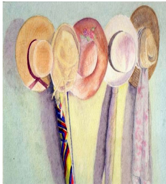
Transforming Lives One Sister At A Time