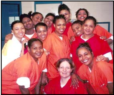
“Sisters helping sisters in need of positive influences”

STS is a rehabilitative program that links female offenders in need of positive influences with women who live, work or fellowship in Prince George's County. This Livable Communities Initiative provides support through one-on-one mentoring, life-skills development classes, transitional housing and community support resources.