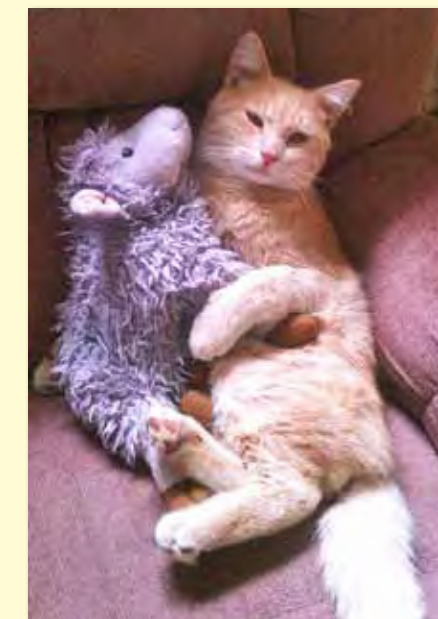
A happy Sunny resting with a toy.

with AMD, agreed to take the cat and cover the cost of the medical treatment. The cat, now known as "Sunny," stayed at the animal hospital for several days recuperating from his injuries. Luckily, the swelling in Sunny's back receded, and eventually, he could urinate and slowly move around on his own. Sunny is currently in a foster home getting stronger every day while working to rebuild the muscles in his legs. As you can see from the photo, Sunny is living the good life, thanks to the help of everyone involved in getting him off the street and into a foster home until he is available for adoption.