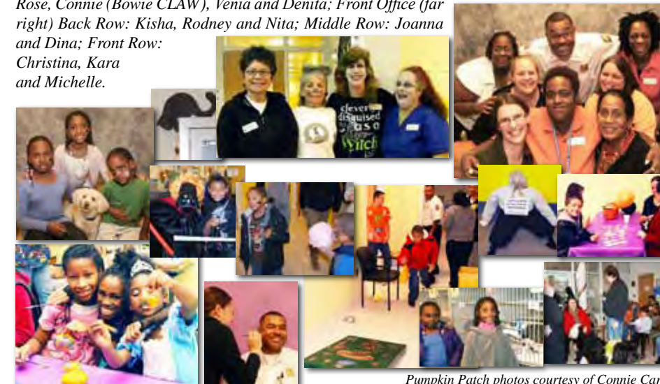
Pumpkin Patch photos courtesy of Connie Carter.