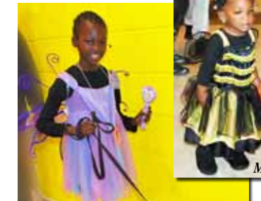
Fairy & Princess