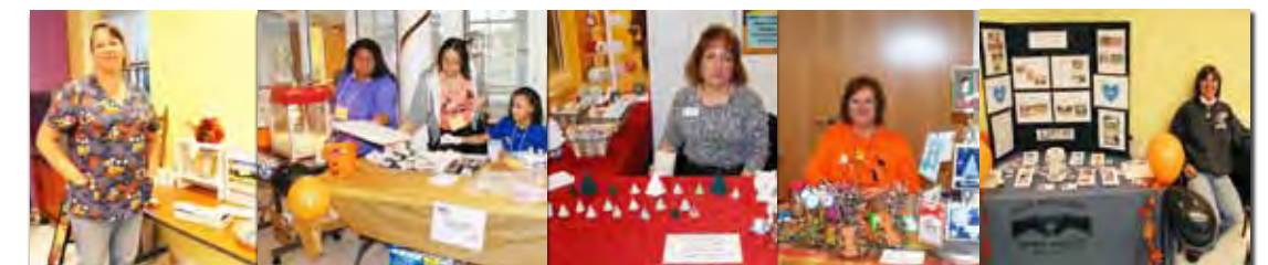
Staff and volunteers work the yard sale booth, bake sale table, craft fair items and informational booth from Days End Farm Horse Rescue.