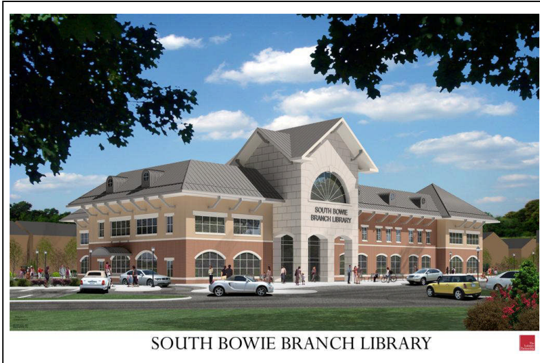
Drawing for conceptual purposes only