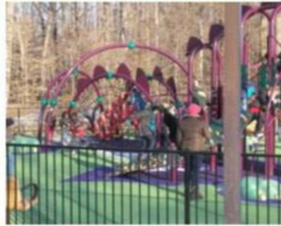
The Maryland – National Capital Park and Planning Commission, Prince George's County Department of Parks and Recreation is proud to show off the newly installed 'destination' playground for the entire community to enjoy.

Small appliances and computers draw power when they're plugged in. Shut down the computer and printer when not in use. Unplug battery charger, toaster, coffee pot, and iron until you need to use them.