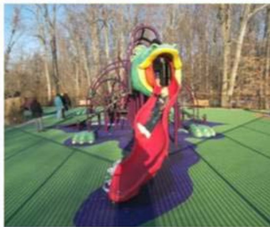
This playground is the first of its kind in the nation for the youth of Prince George's County. With issues such as childhood obesity are the forefront of our concerns, this is a perfect opportunity for our children to get out and exercise. Please feel free to take a look at our District's new jewel when you are in the area.