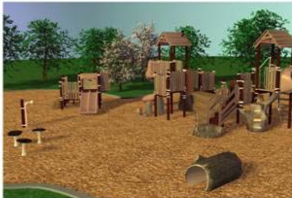
Meadowbrook Neighborhood SPARKS play Bowie, MD 14443483-1-2 6/8/2010