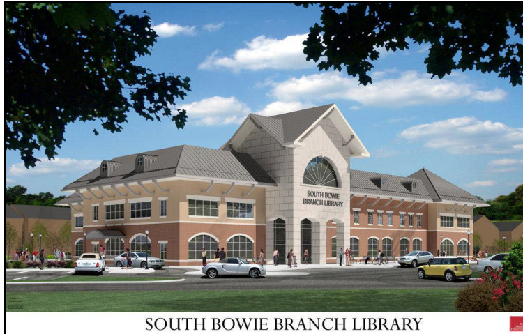
SOUTH BOWIE BRANCH LIBRARY