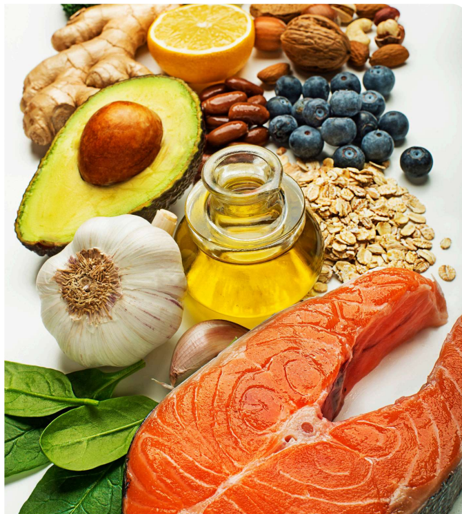
You can help improve your cholesterol by eating foods that are lower in saturated and trans fats.