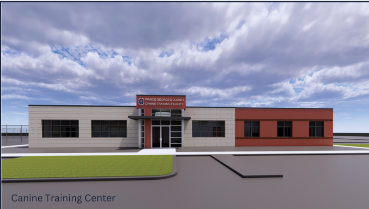
Canine Training Center