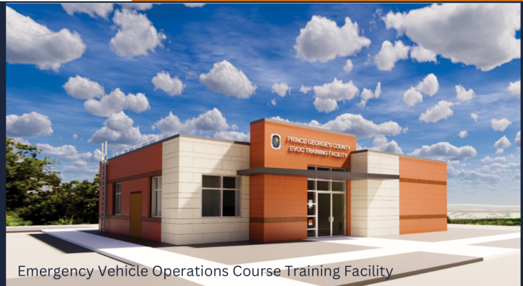
Emergency Vehicle Operations Course Training Facility