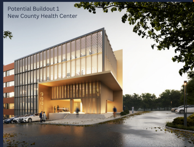
Potential Buildout 1 New County Health Center

The new location will help expand the capacity of the County's public health services, including provisions of vaccinations and key public health services. It will also meet operational, storage, meeting, and office space needs.