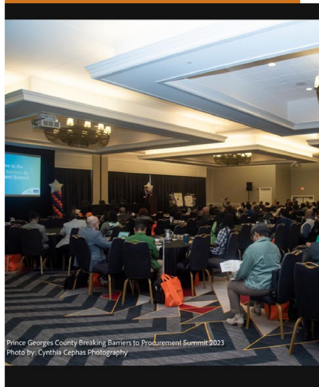
Prince Georges County Breaking Barriers to Procurement Summit 2023