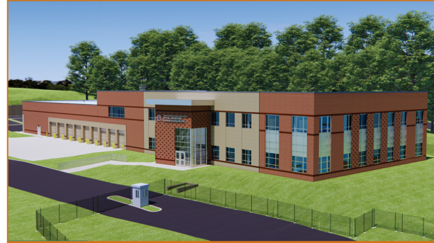
Special Operations Division Facility