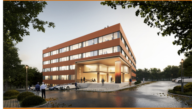
Potential Buildout 2 New County Health Center